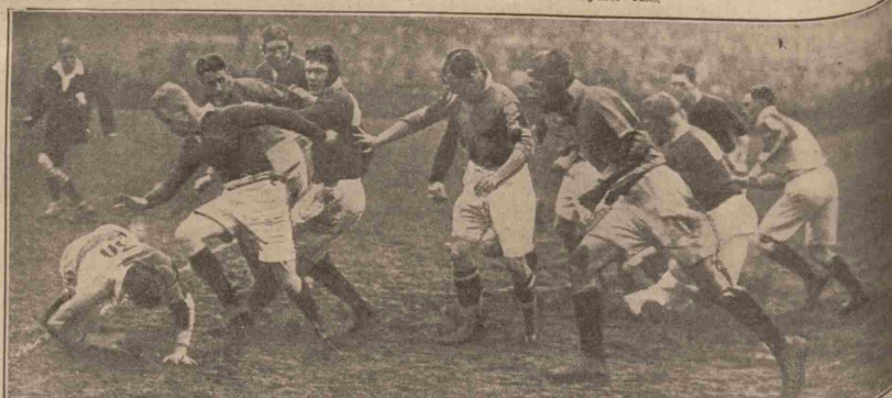
HARLEQUINS AT DEVONPORT.—One of the Harlequins side, who gained a one-point victory, breaking up an attack by the Services.