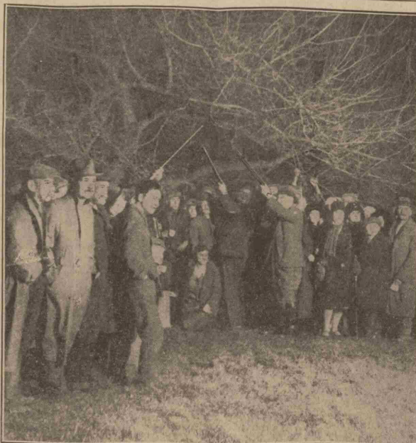
"WASSAILING" THE APPLE TREES.—Firing through the branches of the apple trees to frighten the "little imps of evil" during the "wassailing" at Carhampton.