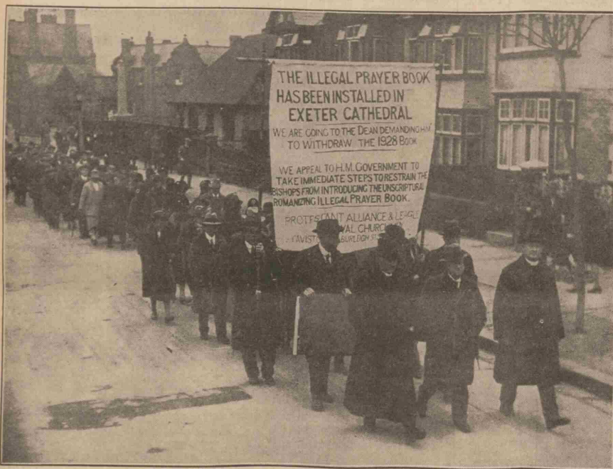
PRAYER-BOOK PROTEST.—The procession proceeding to the Deanery on Saturday to deliver the protest against the use of the 1928 Prayer-book in Exeter Cathedral.