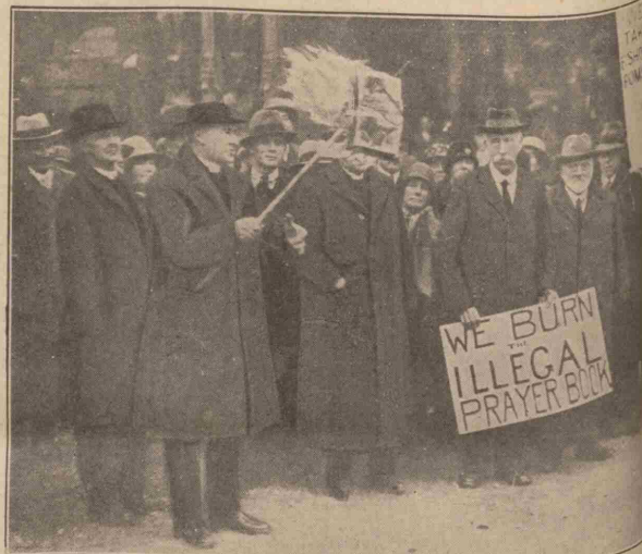
A COPY of the "Illegal" Prayer-book of 1928 being burnt outside Exeter Cathedral.