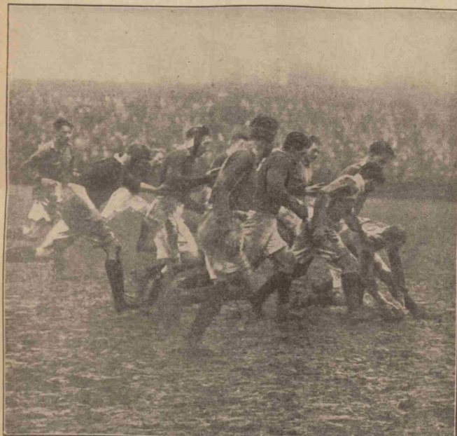
IN THE LOOSE.—A "pick-up" by a Harlequins forward in the match with Devonport Services at the Rectory on Saturday.